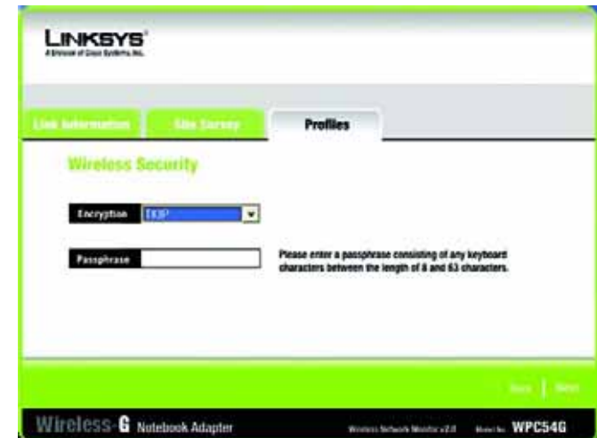
Figure 6-16: TKIP Settings

Select TKIP for the Encryption Type . Enter a WPA Shared Key of 8-63 characters in the Passphrase field.